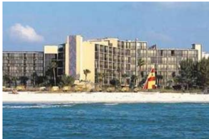
SMA 2008 will be held at the TradeWinds Island Resorts in St. Pete Beach, Florida, October 29 through November 1, 2008.