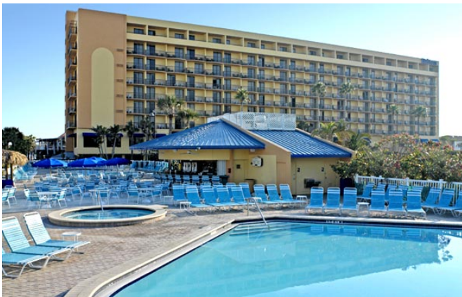
Swimming pool area at the Hilton Clearwater Beach Resort, site of the SMA 2006 meeting.