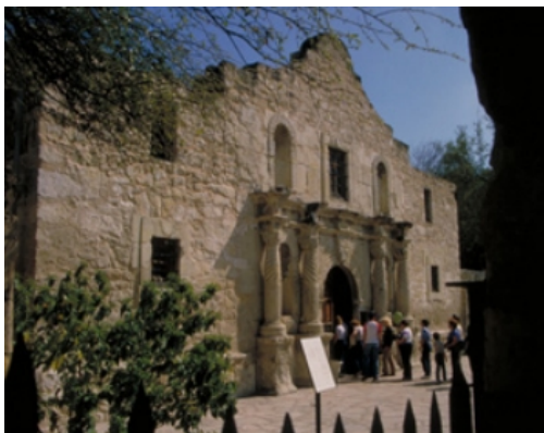
The Alamo is one of the attractions in San Antonio, Texas where the 2004 SMA meeting will be held, November 3-6.